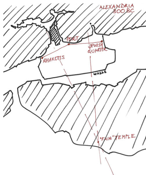
FIGURE 1 Alexandria, 300 B.C.

of the fair temple: a swamp, ten miles outside of Alexandria.